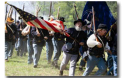
Mansfield Historic Battle Site

Hugging the shores of the Sabine River we hitch a ride on Highway 171 south, still following Louisiana’s scenic byways to the largest military installation in Louisiana, Fort Polk, home to the great Louisiana maneuvers and where some of the greatest leaders in our nation's history trained for World War 2 in the 1940s. Ft. Polk is currently home to the Joint Readiness Training Center.