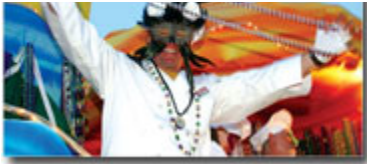
Mardi Gras Celebration

the Cane River Country exists. Natchitoches is the beginning of the El Camino Real de los Tejas, a National Historic Trail, the area includes a National Heritage Area, National Park, a collection of historic Creole plantations and State Historic Sites. This vibrant community is internationally known for their world famous Christmas Festival and offers monthly festivals that celebrate their culture, music and cuisine throughout the year.