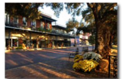
Front Street in Natchitoches, LA

We encourage you to continue your journey and explore all regions of Louisiana North on www.exploreloouisiananorth.com