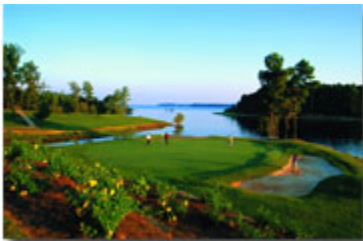
Cypress Bend Golf Resort

A visitor can crisscross all over this part of Louisiana and find something interesting at every fork in the road but we're heading south along Highway 15 to the Stars & Stripes Capital of Louisiana!!! This small community located east of Monroe is one of the most patriotic cities in America and proudly displays over 400 American flags during patriotic holidays but like every Louisiana community you'll find the food and in Winnsboro it is all about the pond-raised catfish industry and their annual Catfish Festival in April salutes this culinary delight with one of the largest one-day festivals in the state. Not bad for a community of only around 6,000.