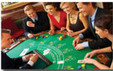
Casino Luck in North Louisiana

Howdy, bon jour, hola and hey ya'll from central and north Louisiana. The diversity of the area is everything a traveler is looking for with 5 golf destinations on Louisiana's Audubon Golf Trails, host to the famous BassMaster Classic (2009 & 2012) legends and myths;